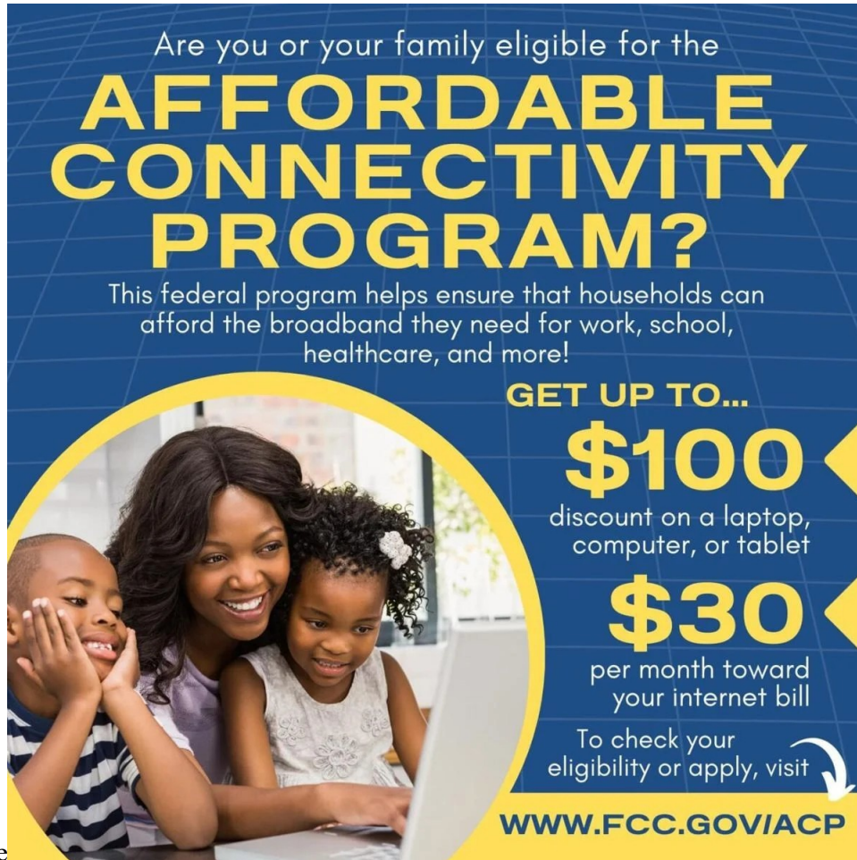
EXHIBIT 4: SAMPLE ADVERTISEMENT