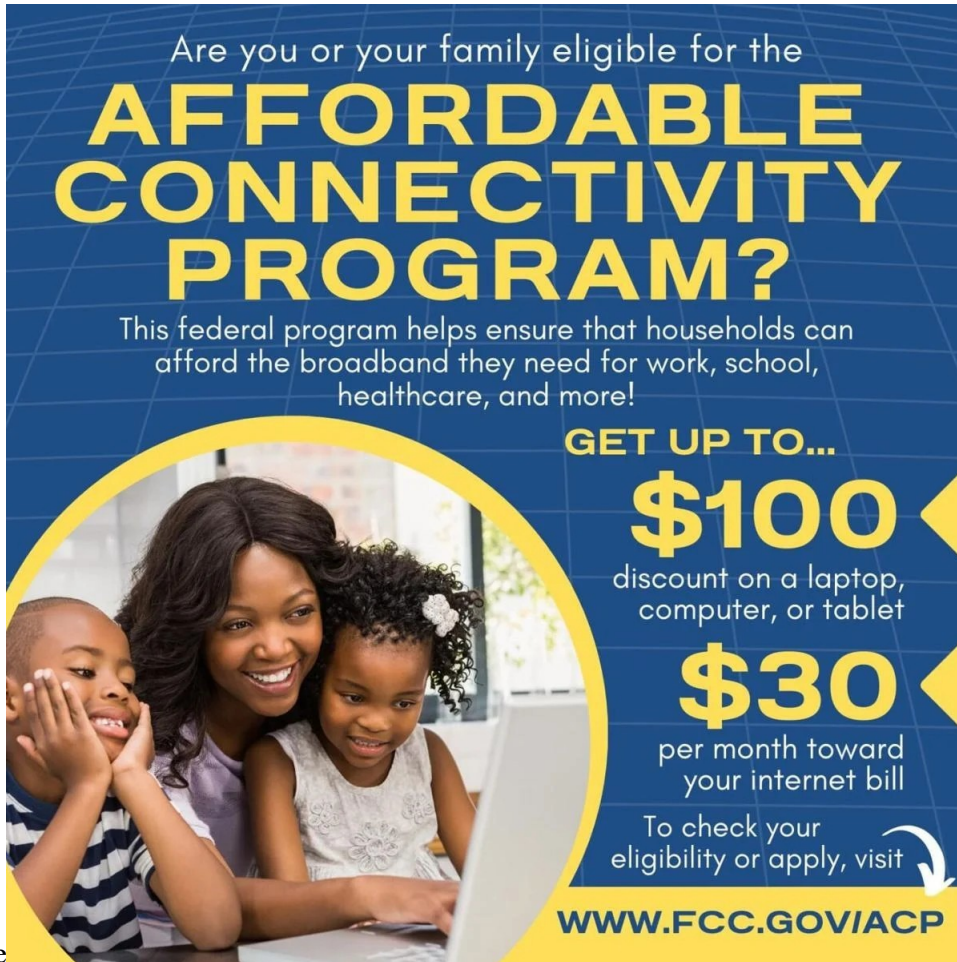
EXHIBIT 4: SAMPLE ADVERTISEMENT